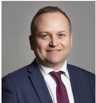
Neil Coyle MP

During the past year or so, the world as we know it has changed and brought with it exceptional circumstances and unprecedented challenges to our communities. More than ever, the pandemic has demonstrated the necessity of everyone having access to a safe and secure home for our wellbeing and dignity. The Government's response to the pandemic through the Everyone In initiative and subsequent programmes showed us that with bold policy action, people experiencing homelessness or at risk can be protected and supported away from rough sleeping.